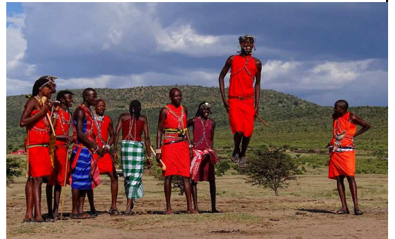
Masai warriors have jumping contests to win the hands of their brides

Please pray for our teams from April 5-27 and if the Lord directs your heart, you may donate any amount toward a traveler, or the trip as a whole.